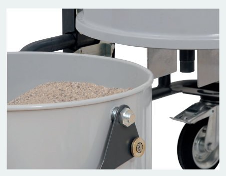
Solid cut-off system