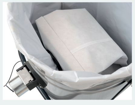
Optional safe bag