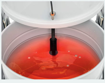
Liquid cut-off system